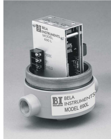
Model 690L in Standard Aluminum Explosionproof Enclosure (shown with cover removed)